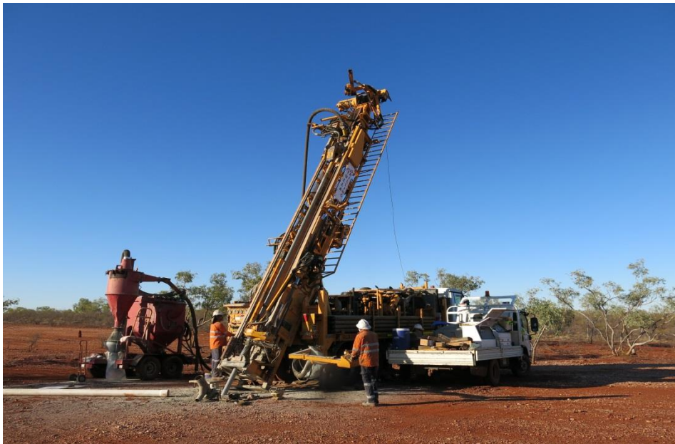
RC drilling at the Lady Mary Prospect

The Lady Mary prospect has previously returned high grade rock chip samples (max 102g/t Au and 5% Cu), with an associated anomalous gold(-copper) soil zone with a strike length of around 450m. This zone is marked at surface by a line of shallow pits.