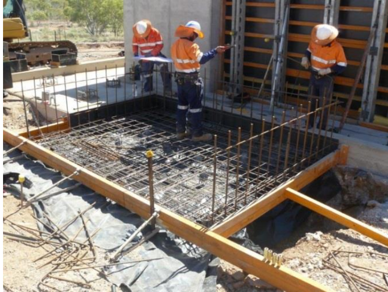
Photo 1: Concrete works being carried out at the Lorena Gold Project in April 2014

BCD is required to fund the development of the Lorena Gold Project to earn its 50% economic share. BCD has spent approximately 1.908 million on the project to date.